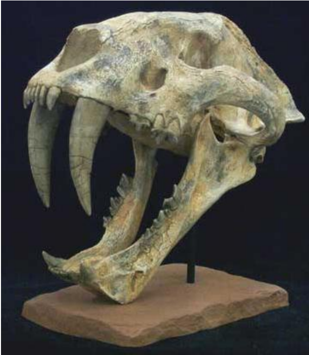
Machairodus Skull with base 18", $350