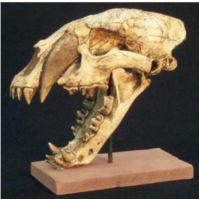
Machairodus Juvenile No. 2 Skull with base, 10" Juvenile $225