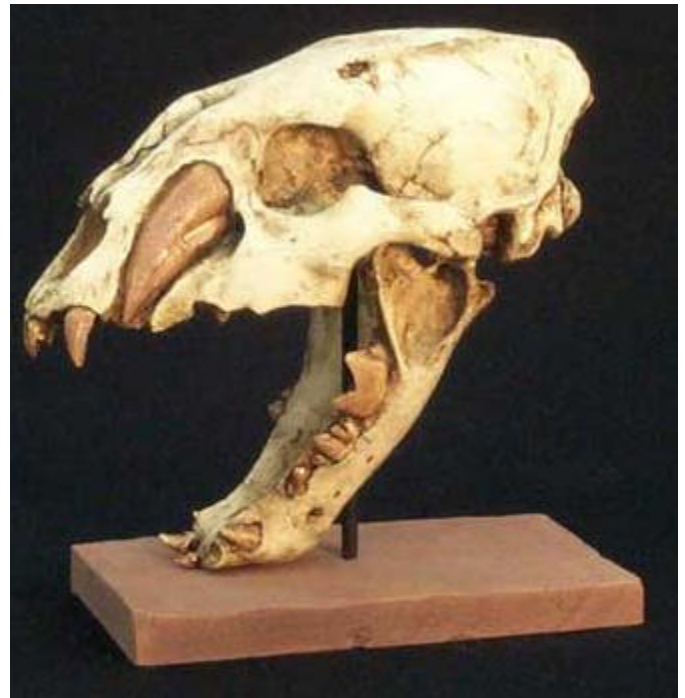
Machairodus Juvenile No. 1 Skull with base 9.5" Juvenile $225